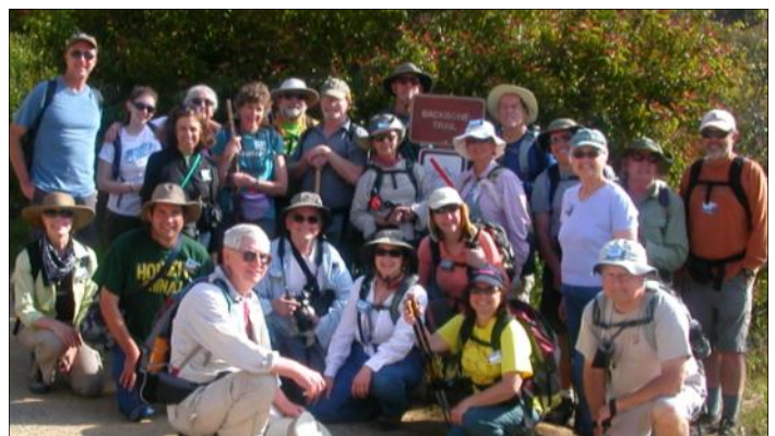
On the 2010 Backbone Trail Trek, twenty hikers with the leader and two sweeps stop for a trailhead photo.