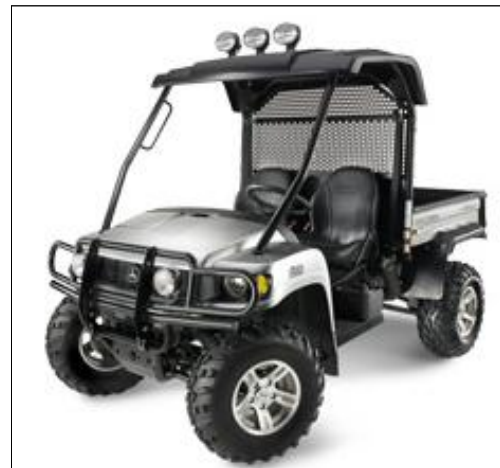
With Trails Council funding, State Parks will be buying a John Deere Gator utility vehicle similar to the one shown here.

A new utility vehicle is being funded by the Trails Council for State Parks in the Santa Monica Mountains to haul heavy tools and supplies to work sites, especially to sites far from trailheads. Funding for the approximately $10,000 purchase was approved by the Trails Council board on September 23.