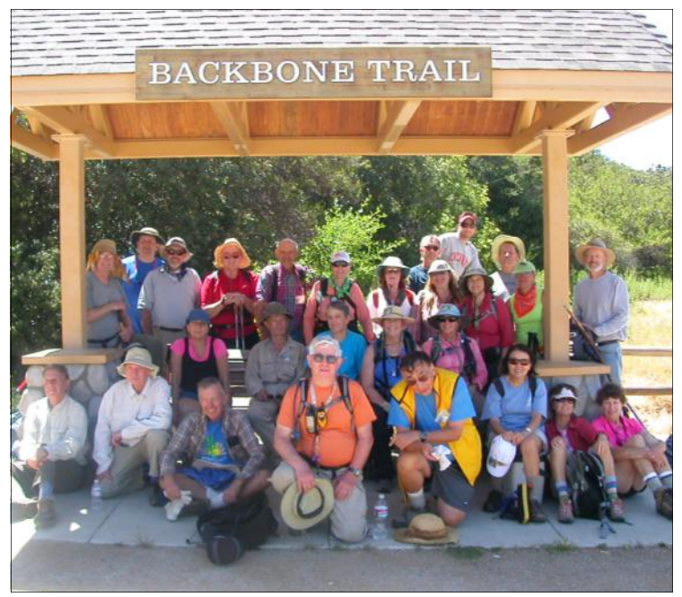
The 2011 Trekers paused at the Kanan Road trailhead.