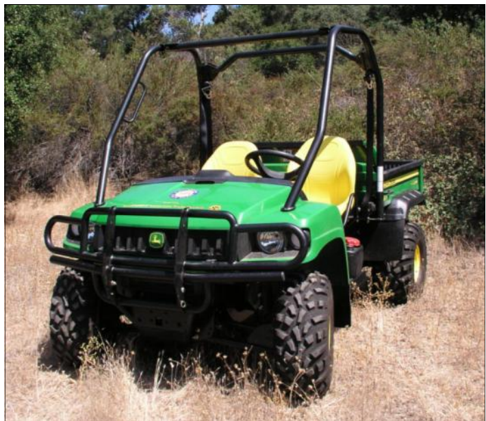
This vehicle was donated by the Trails Council to State Parks. Story on page 1.