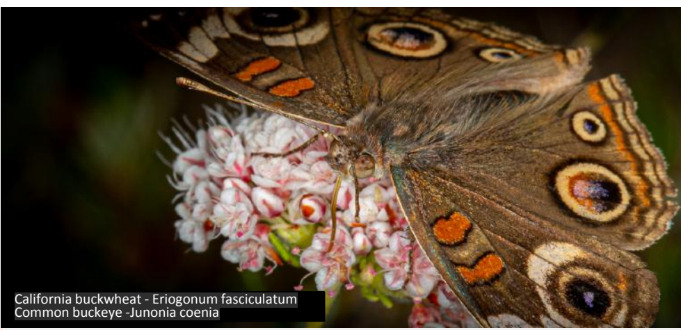
California buckwheat - Eriogonum fasciculatum Common buckeye - Junonia coenia

Do you see and experience more by going faster, or is it possible that you could see and experience more by going at a slower pace?