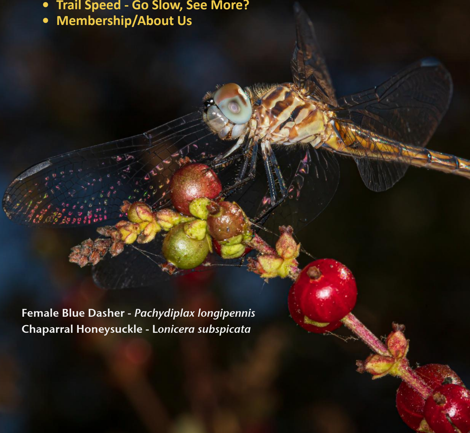
Female Blue Dasher - Pachydiplax longipennis Chaparral Honeysuckle - Lonicera subspicata