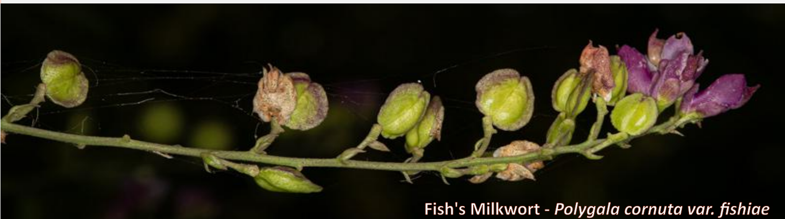
Fish's Milkwort - Polygala cornuta var. fishiae